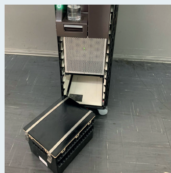
Insulated water tank, 10 liters