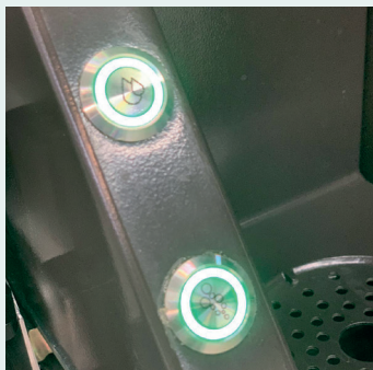
Choose between sparkling & still water