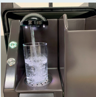
UV dispensing light sterilises drinks and cups

This add on or stand-alone module complements the service onboard for thirsty and sustainability conscious passengers. With this plastic-free water service , passengers can hydrate with an option of still or sparkling water either in a cup in a re-fillable bottle. This solution works both in an complimentary or retail onboard service.