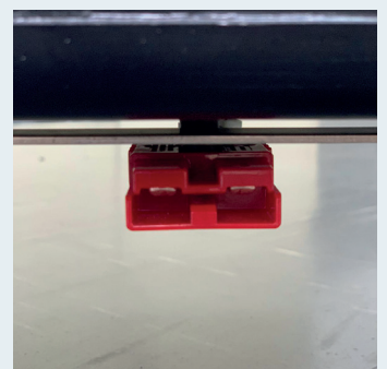
Battery charging directly in trolley, using an external plug