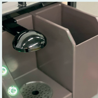
Mini-Storage container (non-removable) for service