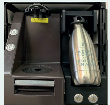
Cup and Bottle filling