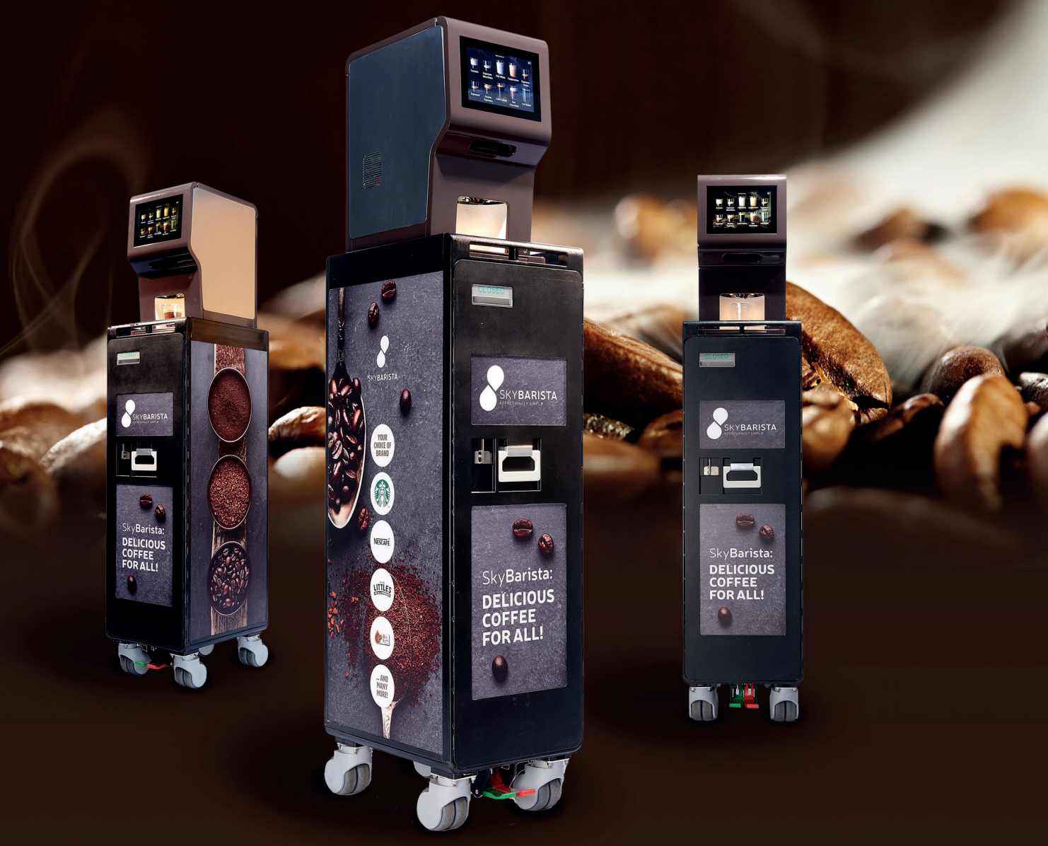
Sky Barista | ONE

Let your customers enjoy coffee, tea and hot chocolate with the SkyBarista platform. Increase your ancillary sales and customer satisfaction by serving a variety of coffee specialties, tea and hot chocolate - in a cup or as a pot service.